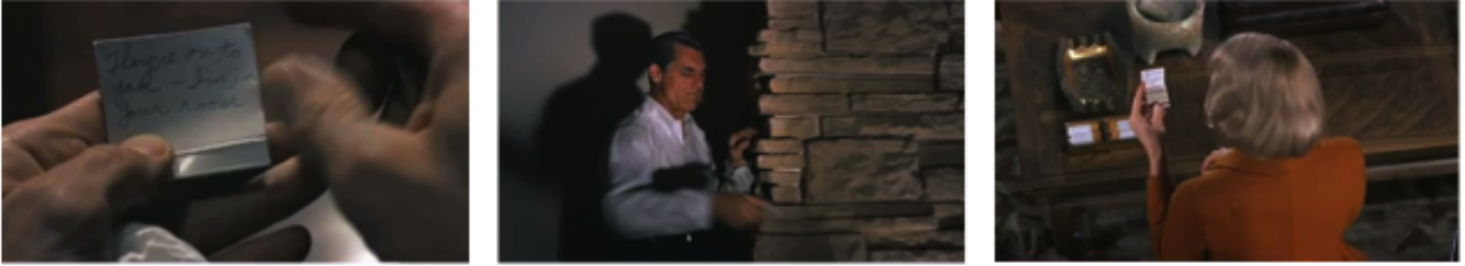
Figure 1. Three frames of the matchbox scene in North by Northwest.

bourbon, box, city, dress, dritte, drunk, Eva, girl, matchbox, mother, Mount, office, peak, Philip, plane, police, Roger, Rushmore, searchers, secretary, skirt, station, studio, suit, sunset, tunnel, unsichtbare, waterfront, woman. Most tags refer to characters (“Roger”, “mother”) or their qualities (“blonde”, “dress”). According to the structural ontology (see details in [5]), the content tags of the scene above could be referred to: